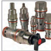
Cartridges & Manifolds