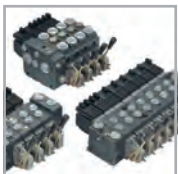
Directional Control Valves