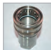
SS 316 Quick Release Couplings