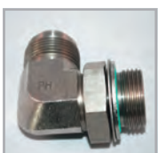
316 SS Threaded and Compressions Adaptors