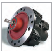
Globe Air Motors