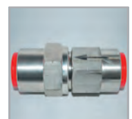
316 SS Valving and Accessories