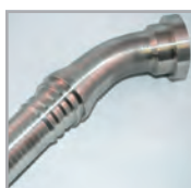
316 SS Hose Ends