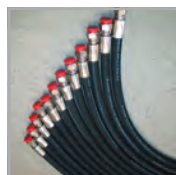
Hose & Fittings