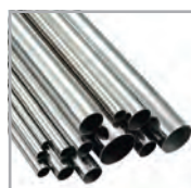
SS 316 Seamless Annealed Tube