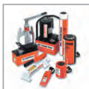
High Force Equipment